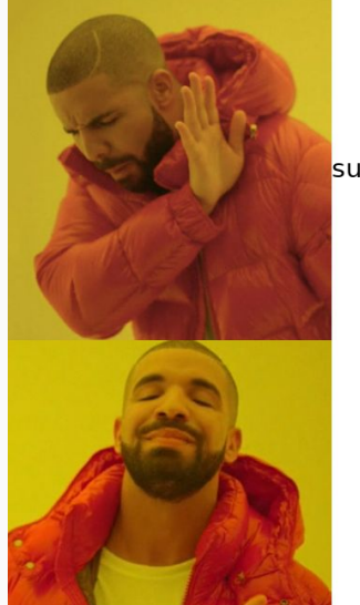
sudo apt-get install emacs

users can build and install software without root privileges