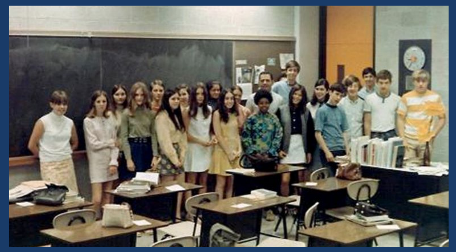
Class of 1971 * Weston High School, Weston Connecticut - 1969